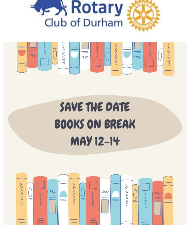
IF YOU ARE PLANNING TO VOLUNTEER,